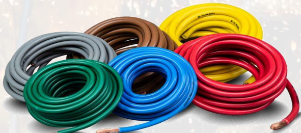
Welding Cables for electric arc-welding machines to power an electrode.