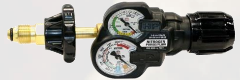
Victor Edge Series 2.0 Nitrogen Purge/Flow