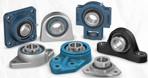
Plummer/Pillow Block Bearing