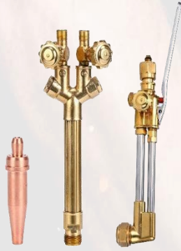
Welding Torch Kit Heavy Duty Oxygen/Acetylene Cutting,