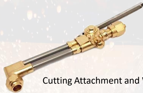
Cutting Attachment and Welding