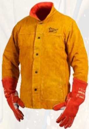
Welding Jacket and wears Leather Apron Anti-scald Flame Resistant Coat

VictorESAB Victor Performer 540/510 EDGE 2.0 Outfit