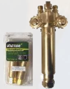
Two Hose Machine Torch